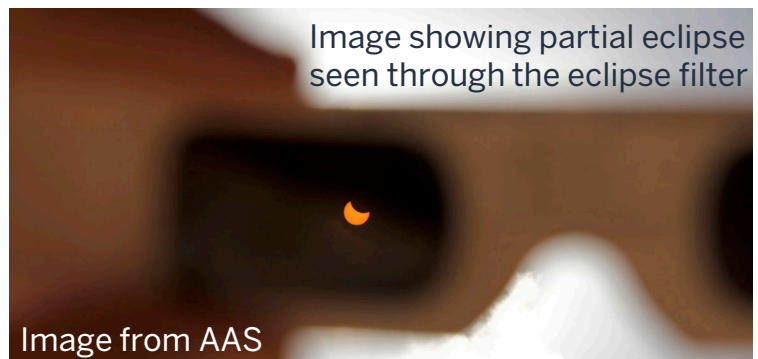
Image showing partial eclipse seen through the eclipse filter

If you need to clean the eclipse filter, the AAS recommends using a soft, nonabrasive tissue or cloth such as a microfiber cloth or Kimwipes. DO NOT use water, glass cleaner, baby/wet wipes, or any other solvents or liquids to clean the filters.